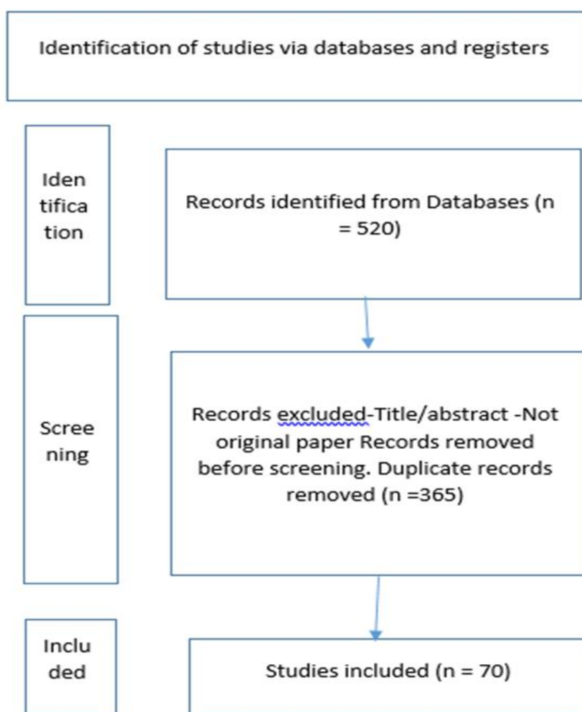
Figure 1. Diagram of how studies were selected

In this review, the articles registered in English and Farsi without language restrictions in the reliable scientific databases of PubMed, Google Scholar, and Science Direct using the keywords "Ammi majus", bishop's weed, lady's lace, Vaye, Gol Sefid, Anti-inflammatory, antibacterial, anti-inflammatory, antioxidant and cytotoxic, vitiligo, psoriasis" was investigated with the aim of investigating the therapeutic effects of Ammi majus.